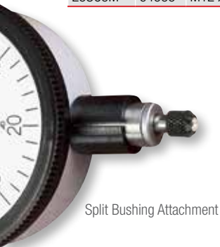
Split Bushing Attachment