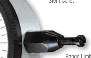
Range Limit Cap