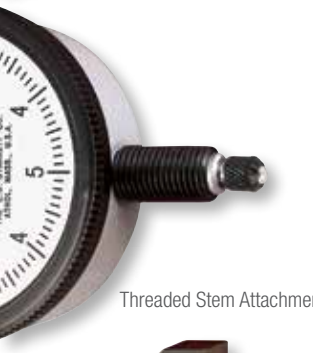
Threaded Stem Attachment